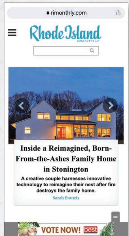
ADHESION UNIT EXAMPLE.

All materials must be submitted at least 3 days prior to start date.